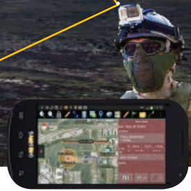
Android Team Awareness Kit (ATAK)