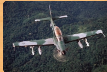
Embraer T-29 Tucano/Super Tucano