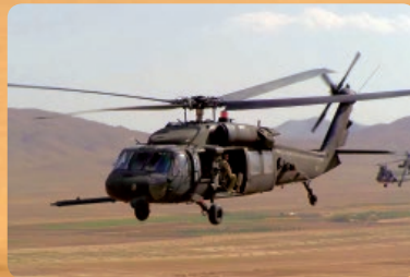
Black Hawk HH-60